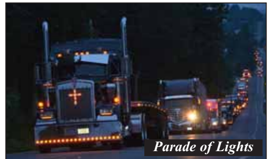
Parade of Lights

8:30 PM (approximately)—Trucks arrive at Mt. Hope Auction; music by Aaron Aaron & Liberated for Him