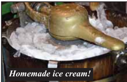
Homemade ice cream!