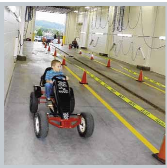
Open House Scenes: Top, visitors had the rare opportunity to see a grease pit from the inside; bottom, kids had a ball playing in one of the wash bays.

And he truly enjoys his job. "The many friends I've met over the years in this business and the great group of coworkers I'm privileged to work with have been a tremendous encouragement in my life," he said. "My hope and goal is to bless them as much as they've blessed me.