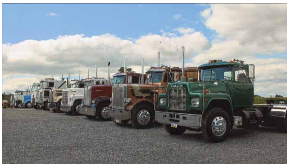
Opposite page, top: Lanita's new facility in Mt. Aetna