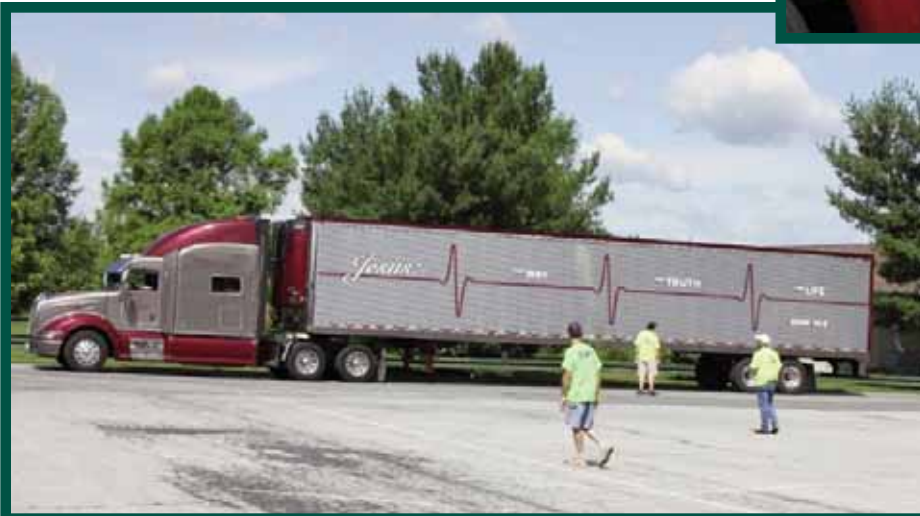
The tractor was featured in the June 2015 Highway News—where he tells the story of purchasing a 2013, 386 Peterbilt glider kit!