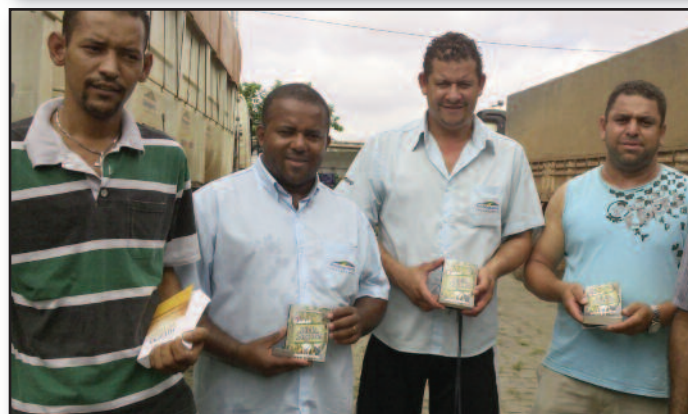
Top—Paranaguá Port triage area