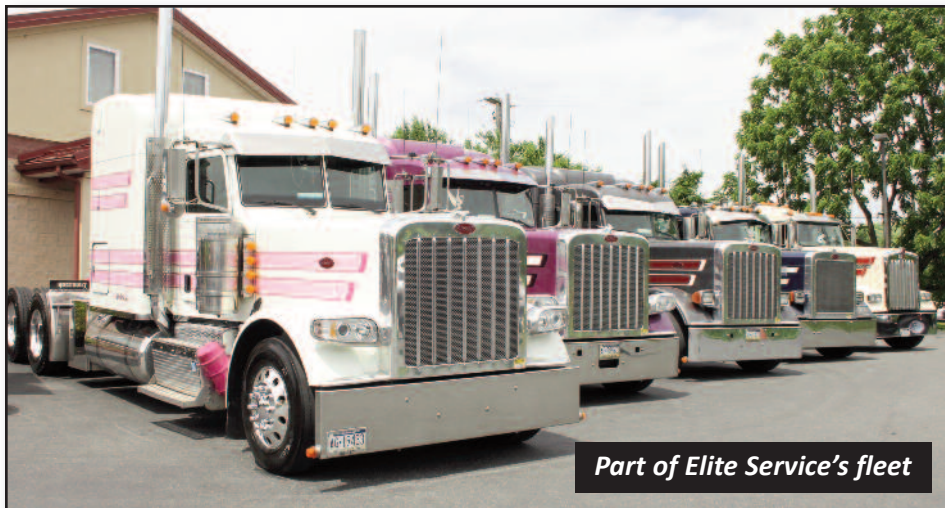
Part of Elite Service's fleet