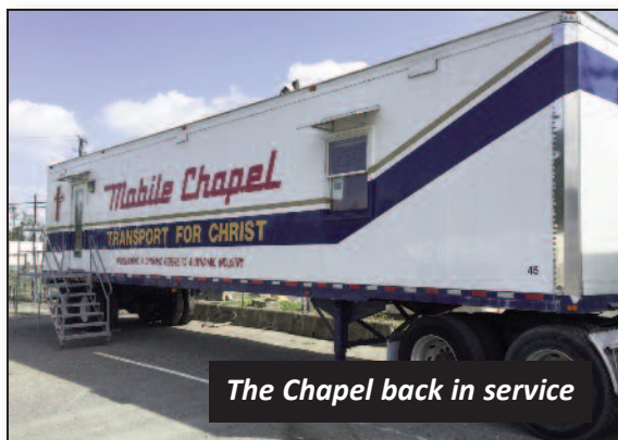
The Chapel back in service